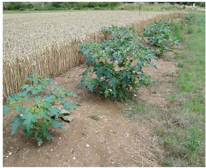
D. stramonium at the border of a wheat field near Frankfurt, Germany.

My short histology note of this Newsletter is devoted to Datura stramonium L. (Bayer code: DATST) or Jimson weed. It is a typical member of the Solanaceae family. This means it produces toxic alkaloids. All plant parts contain the tropane alkaloids atropine, hyoscyamine and scopolamine. A transverse section through leaves, petioles and the stem reveal bicollateral vascular bundles. The spectacular fruits are spined capsules which split into four chambers. D. stramonium is native to North America. Today, it can be found all over the globe where it prefers warm or moderate habitats. In Germany, it grows along field margins, sometimes in sugar beet fields and from time to time in ornamental fields.