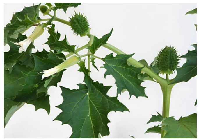
Fruits and flowers of D. Stramonium .