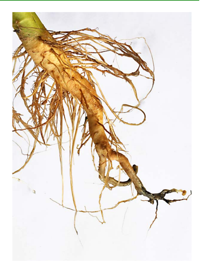
Roots are tap roots very similar to those of tomatoes.