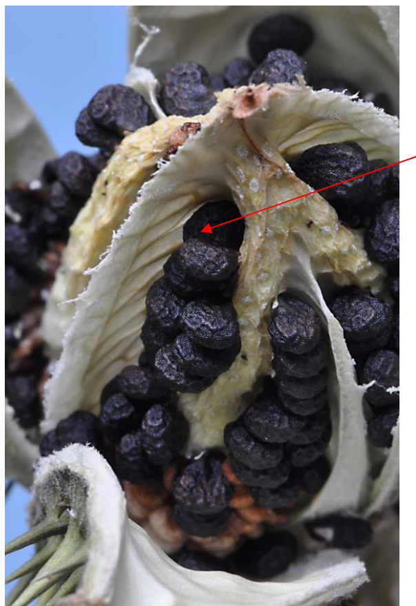
Seeds arranged along placenta (arrow)