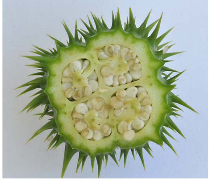
Transverse section of a capsule showing the four seed chambers.