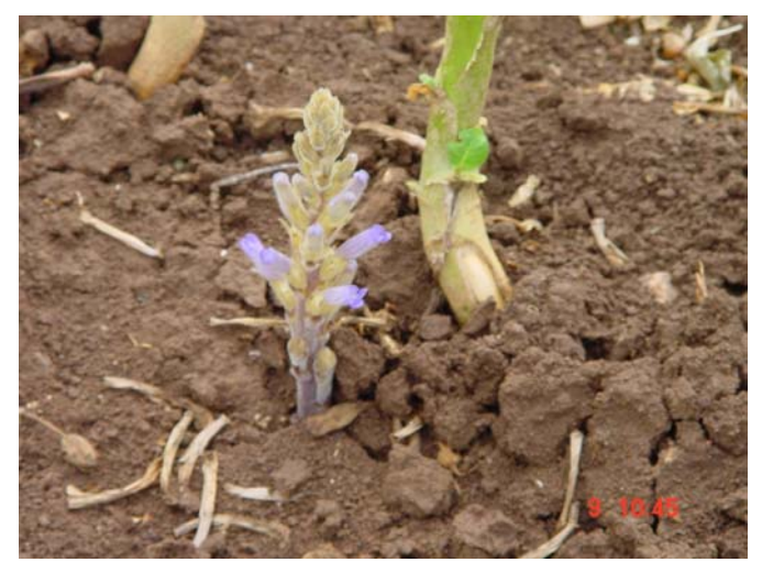
Orobanche ramosa in tobacco crop.

65 broomrape populations were collected throughout Greece parasitizing tobacco, tomato, faba bean, carrot and pea crops, with the aim to study the extent of morphological, genetic, physiological variability. Spatial heterogeneity was also studied for the sampling regions. 17 morphological