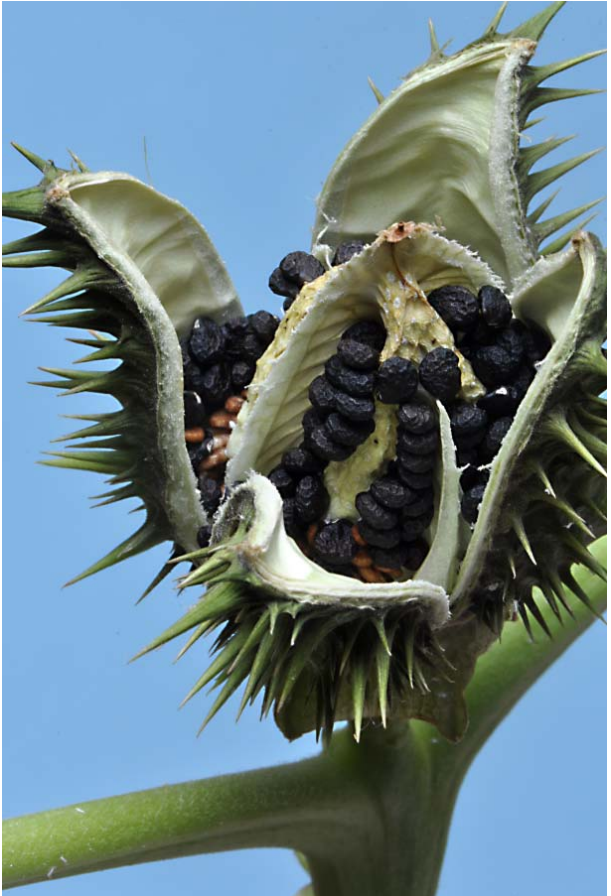
Ripe, opening fruit