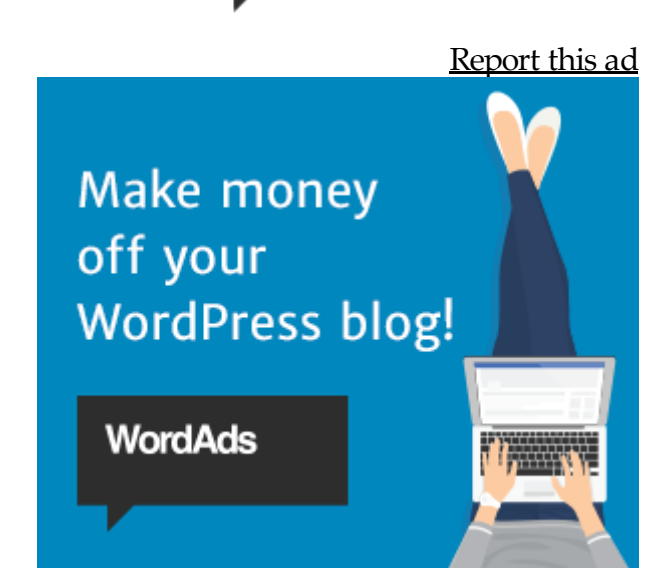
Report this ad