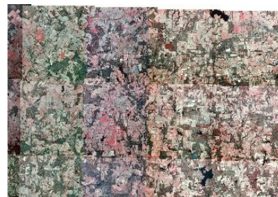
Figure 3. Images before color balancing

Color balancing is the process to change each pixel value to match a target color surface. Dodging balancing uses traditional photogrammetric dodging algorithm to change each pixel value to target color derived from target color surface. Depends on the size and variations in the source data, there are five target color surfaces to choose from, single color, color grid, first order surface, second order surface and third color surface. Target color surface can either be generated from the source data or derived from a target dataset. Other balancing methods change pixel values according to the statistics distributions of the target data source, for example histogram balancing and standard derivation balancing. Figure 3. shows the mosaic dataset with images of different color tones and Figure 4. shows the same mosaic dataset after applying color balancing.