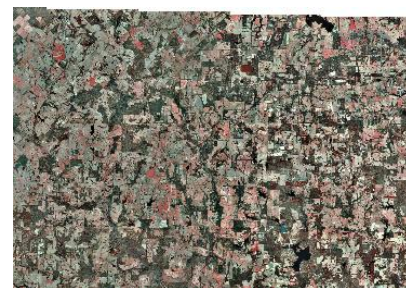
Figure 4. Images after color balancing

When the images in an image collection overlap with adjacent images, color matching technique can be deployed. Color matching simply uses the overlapping pixels to compute color transformations from source image to target image. The