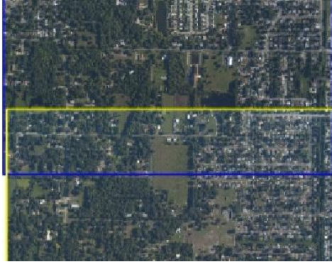
Figure 5. Images before color matching

computation uses one of the three matching options: histogram matching, statistics matching and linear correlation. Once the transformation formula is calculated, all pixels in the source image will be transformed to match the target. Figure 5. shows the source data before color matching and Figure 6. shows the same data after color matching. The top data is to be matched to the bottom image which is the reference data.