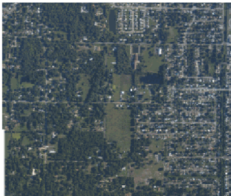
Figure 6. Images after color matching