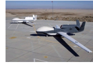
Streamlined rules for robots