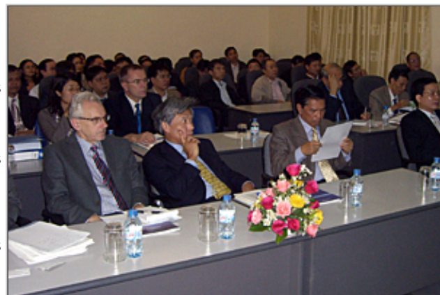
Attendees at the first plenary meeting of INIR to Viet Nam

See Story Resources for more information.