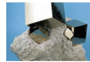
Probing the surface of pyrite