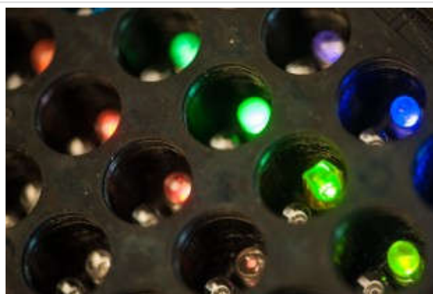
Rice University's low-cost, open-source Light Plate Apparatus can easily be used by nonengineers and noncomputer programmers and can be assembled by a nonexpert in one day from components costing less than $150.

"Over the past 5-10 years, practically every biological process has been put under optogenetics control," said Gerhardt, who works in Tabor's lab. "The problem is that