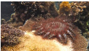
Crown-of-thorns sea star attack2

A crown-of-thorns sea star eating a coral from the genus Acropora , which is a preferred meal for the organism. The photos were taken in the non-protected fishing area on Votua Reef, on the Coral Coast of the Fiji Islands.