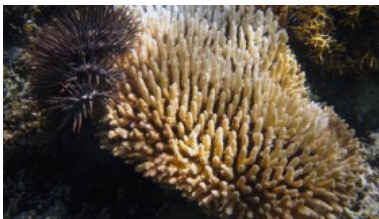
Crown-of-thorns sea star attack

A crown-of-thorns sea star eating a coral from the genus Acropora , which is a preferred meal for the organism. The photos were taken in the non-protected fishing area on Votua Reef, on the Coral Coast of the Fiji Islands.