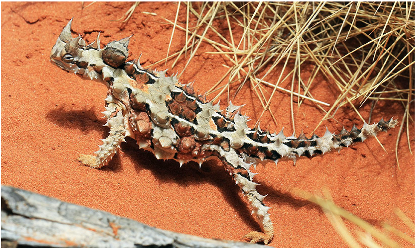
A Thorny Devil ( Moloch horridus ) in the reptile house at Alice Springs Desert Park, Alice Springs, Australia. Stu's Images . Used via a Creative Commons Attribution-Share Alike 4.0 International license.

AUSTIN, Texas — A group of ecologists has started creating a periodic table of ecological niches similar to chemistry's periodic table. And just as chemists have used their periodic table as a point of reference to understand relationships among elements, the emerging table for ecologists shows relationships over time among animals, plants and their environments — acting as a critical resource for scientists seeking to understand how a warming climate may be spurring changes in species around the globe.