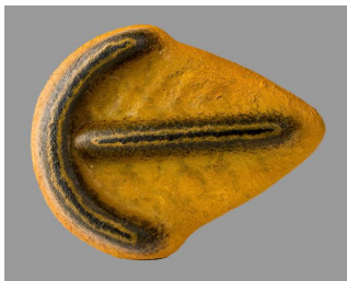
Model of a Parvancorina organism.