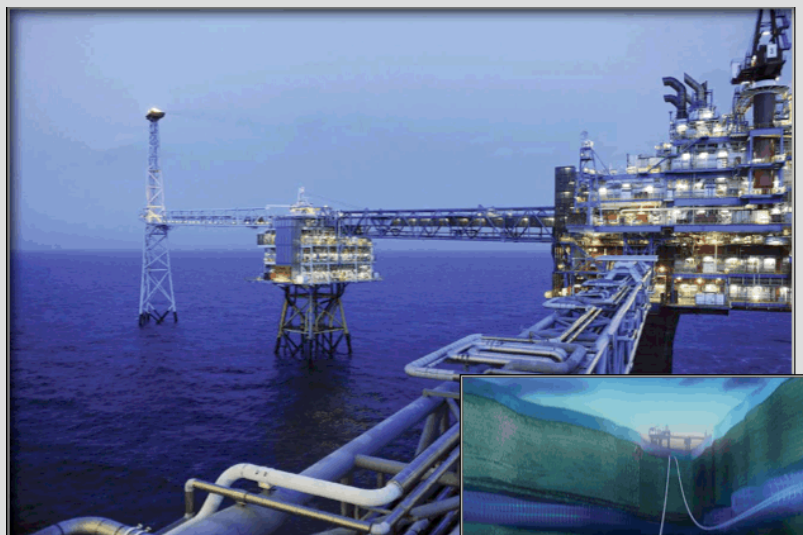
Above. Liquid carbon dioxide has been injected into the Sleipner gas- and oilfield in the North Sea for 15 years without triggering any seismicity. It serves as a good example of how fluid injection can be done safely.

That said, we have known for more than 40 years that earthquakes can be triggered by fluid injection. The first well-studied cases were earthquakes triggered by waste disposal at the Rocky Mountain arsenal near Denver, Colo., in the early 1960s, and by water injection at the Rangely oilfield in western Colorado in the late '60s and early '70s.