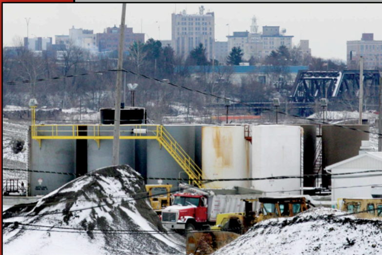
Left. A saline wastewater injection well owned by Northstar Disposal Services LLC in Youngstown, Ohio. Following several small earthquakes in the area in December 2011, the company halted injection of wastewater into the well, which stopped the earthquakes. The wastewater is from the production of oil and gas.