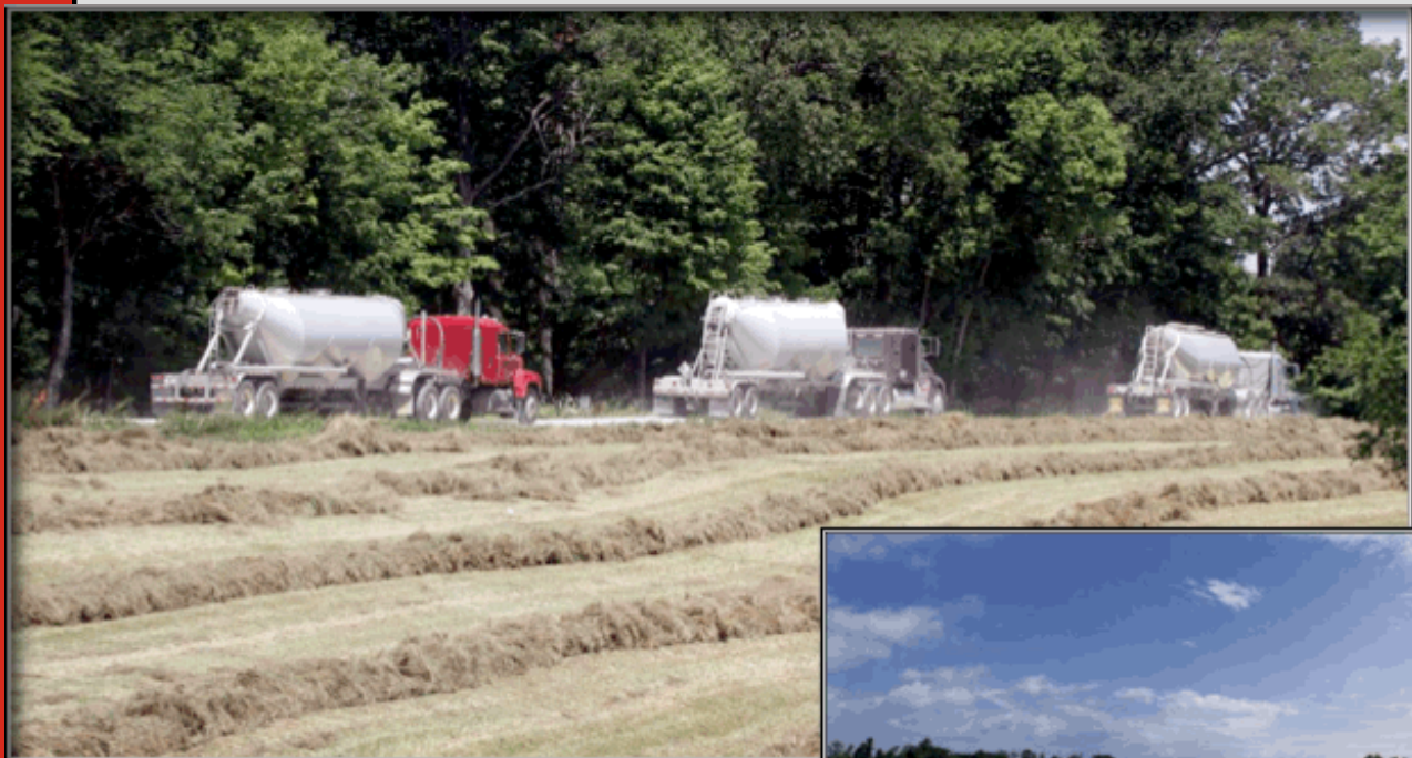
Above. Wastewater from hydraulic fracturing is trucked away from drilling operations in Pennsylvania in the Marcellus Shale and moved elsewhere in the region where it will most likely be reinjected and reused.

We also know a lot about the relationship between the orientation of potentially active faults and the ambient stress field in a given region. This also enables us to identify (and avoid) potentially problematic faults prior to injection. Potentially active faults can be identified because the relationship between the orientation of active faults and the regional stress field is well known from basic principles of structural geology and rock mechanics. In other words, only faults of certain orientations are potentially activated during injection in a given area. The earthquakes apparently triggered by fluid injection at Guy, Ark. occurred on northeast trending, near-vertical faults, consistent with what would be expected from knowledge of the regional stress field and quite similar to the trend of active faults in the New Madrid Seismic Zone immediately to the east. Had these faults been identified during site characterization studies carried out as part of the permitting process, this site would not have been used for injection.