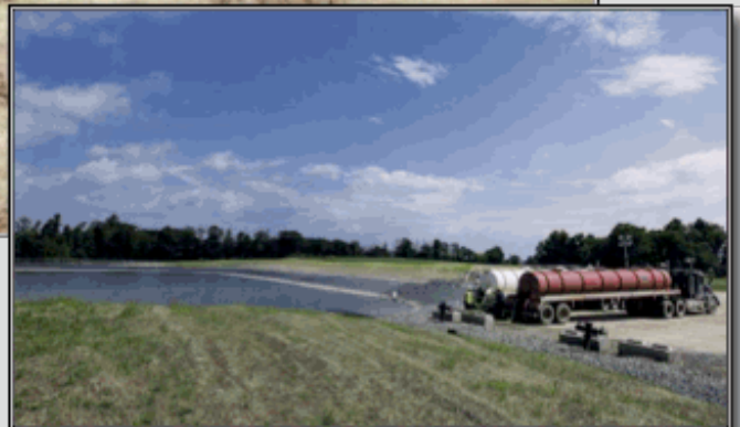
Right. Nearly all of the water used in hydraulic fracturing in the Marcellus Shale is reinjected during subsequent hydraulic fracturing operations. Meanwhile, it is stored in wastewater impoundment ponds like this one in Pennsylvania.