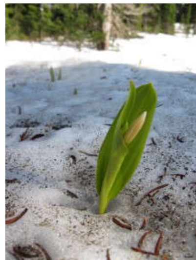
An avalanche lily budding through the snow on Mount Rainier. Elli Theobald

In 2015, conditions were so warm that, on average, snow began to melt at the study plots 58 days earlier than in 2010-2014. The team recorded major shifts in the bloom times of wildflower species. All of the species — 100 percent — flowered earlier in 2015 and 54 percent of species also lengthened their flower duration that year, some by as many as 15 days. The remaining species showed shorter flower duration, in one case by nearly 19 days, possibly due to accelerated soil drying, altered pollinator activity or other factors.