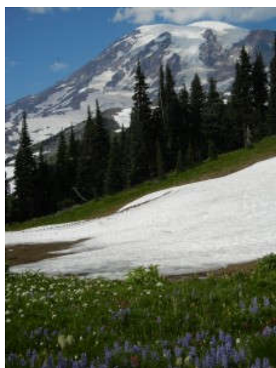
Subalpine setting on Mount Rainier, showing persistent snow near blooming wildflowers. Janneke Hille Ris Lambers

Since species shifted in different ways, conditions in 2015 produced new patterns of reassembled wildflower communities, with unknown ecological consequences.