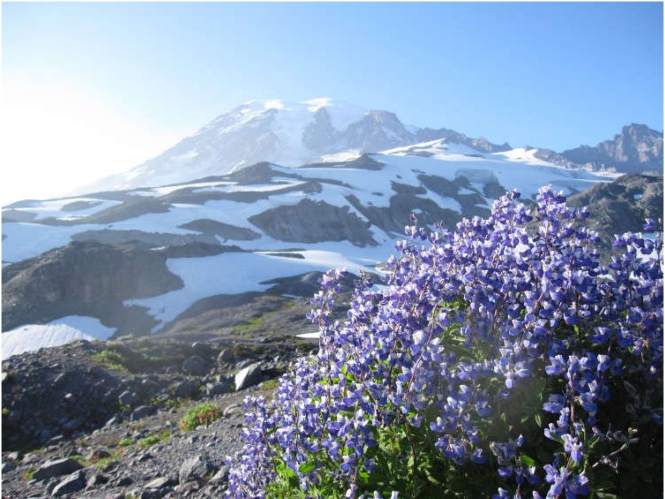
Lupines on Mount Rainier. Elli Theobald

of Washington state. As they report in a paper published online on Oct. 11 in the journal Ecology , an unseasonably warm, dry summer in 2015 caused reassembly among these subalpine wildflower communities.