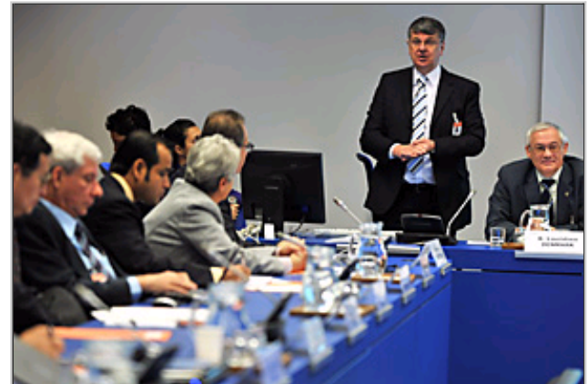
Discussions continue at the IDN's Annual Forum for Regulators and Operators in the Field of Decommissioning which is being held in Vienna this week.

A collaborative initiative between the IAEA Departments of Nuclear Energy, Nuclear Safety and Security,