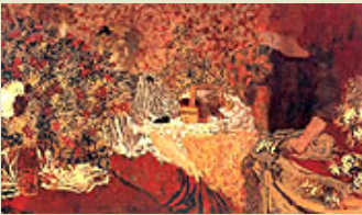
Fig. 4 Édouard Vuillard, La table de toilette , from the Album series, 1895. Oil on canvas. Private collection. © 2002 Artists Rights Society (ARS), New York / ADAGP, Paris