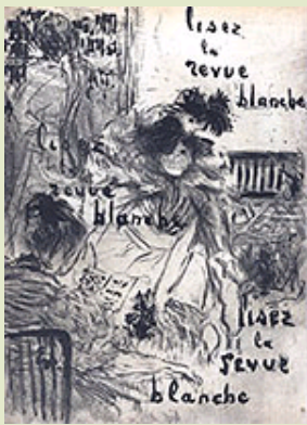
Fig. 8 Édouard Vuillard, Lisez la revue blanche, 1894. Lithograph (R-M 18, first state). Private collection.

M. Odilon Redon has taught the young who surround him what liberties talent authorizes; he has made it possible for them to deepen the resources of their profession through the use of lithography. He possesses to the highest degree those primordial plastic gifts for which they have the very greatest concern and respect. That's what gives profound meaning to his presence. 54