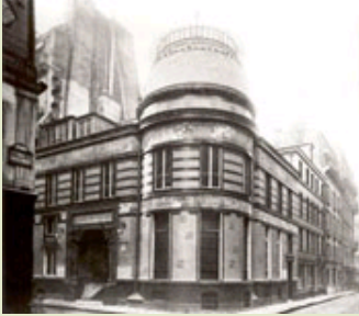
Fig. 6 Exterior view of Siegfried Bing's Maison de l'Art Nouveau at 22 rue de Provence and 19 rue Chauchat, December, 1895.

rayé appears in an unpublished photograph by Vuillard of Vallotton holding an infant by a window in the Natanson dining room (Archives Salomon, Paris). Finally, photographs Vuillard took about 1899 of the billiard room in Misia and Thadée's house at Villeneuve show that L'album and Le pot de grès had been moved there for a time. 16 This evidence, which suggests a curiously tentative, haphazard installation of the panels, led Gloria Groom to conclude that Vuillard expressly designed for the Natansons a kind of portable decoration whose panels could be separated and arranged according to the owner's whim. 17 This deduction contradicts not only Fénéon's catalogue entries but other period sources—including Thadée himself, for whom the panels constituted an harmonious ensemble, one that had, furthermore, been exhibited as such at S. Bing's Hôtel de l'Art Nouveau in December 1895. 18