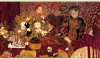
Fig. 5 Édouard Vuillard, Le pot de grès , from the Album series, 1895. Oil on canvas. Private collection.

much less idiosyncratic language than his preceding decorations and exceptionally experiment with the formal innovations of more mainstream contemporary movements in the decorative arts. Though Groom presents ample visual documentation to support her thesis, her proof turns out, as we shall see, to deal with subsequent, truly arbitrary installations of the Album panels rather than with the original one. The purpose of our paper is to demonstrate that the Album panels were originally designed to decorate a small model room in S. Bing's Maison de l'Art Nouveau, as part of a Nabis group commission. Logically following up a somewhat earlier collaboration with Bing, this new commission was to be a further, more important occasion for the Nabis to develop a group aesthetic and to attempt once again to regenerate the original spirit of their brotherhood. Perhaps most significantly, however, the new commission was to be a first opportunity for Vuillard and the Nabis to demonstrate to an exhibition audience their ability to complement and enhance architecturally defined spaces and to show what the function of decoration in relation to architecture should be. 7