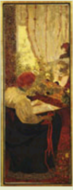
Fig. 3 Édouard Vuillard, La tapisserie , from the Album series, 1895. Oil on canvas. The Museum of Modern Art, New York, Estate of John Hay Whitney (294.1983). Digital image ©The Museum of Modern Art/Licensed by Scala/Art Resource, NY. © 2002 Artists Rights Society (ARS), New York / ADAGP, Paris