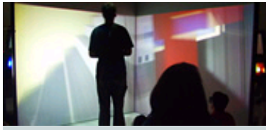
Innovation in Teaching