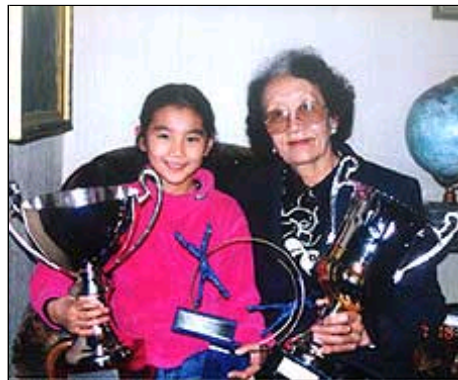
Young contortionist together with her trainer.