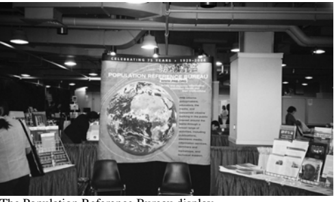
The Population Reference Bureau display.

As always, the exhibit area buzzed with activity...both during setup and during the meetings.