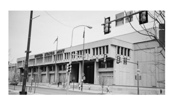
Got any change? There's a chance that some of your coinage was produced here at Philadelphia's U.S. Mint.