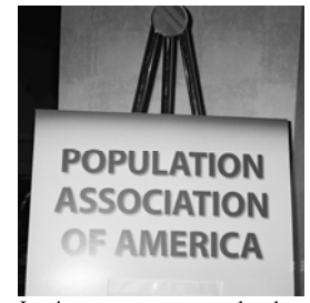
Just in case someone wondered who was meeting...