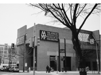
...and the African American Museum.