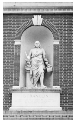
A statue of Benjamin Franklin, arguably Philadelphia's greatest statesman, overlooks the entrance to the American Philosophical Society's Library Hall.