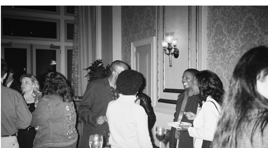
Networking...and enjoying themselves while doing so!