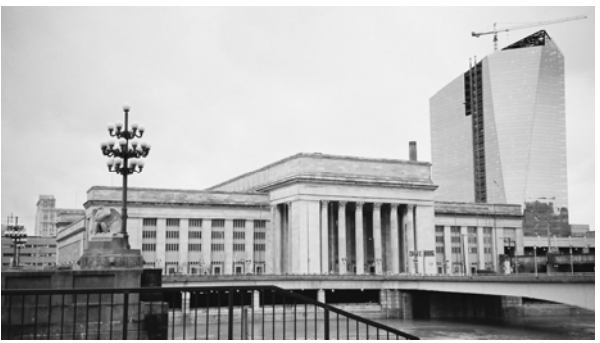
An outside view of historic 30th Street Station, overlooking the Schuylkill River