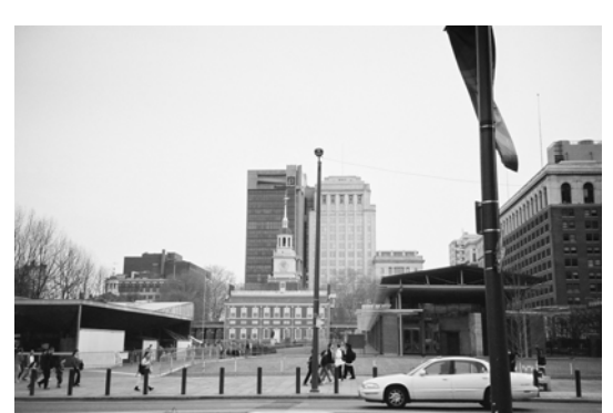
A mixture of old and new, as modern office buildings drape historic Independence Hall.