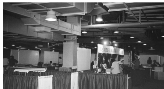
The exhibit hall..."Before"...