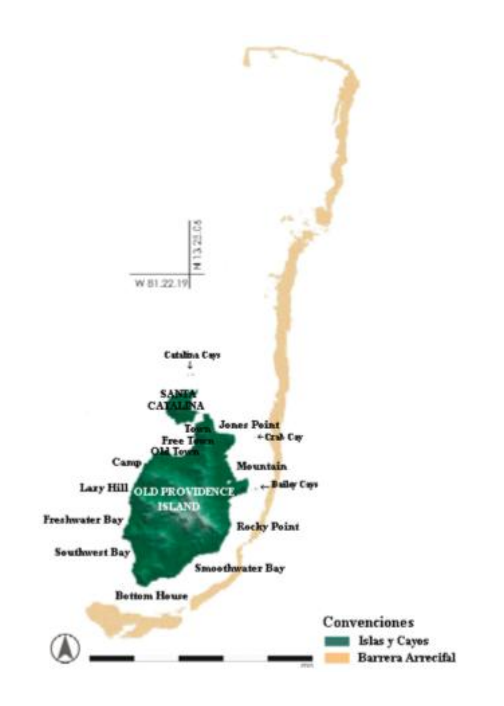
Map 2. Old Providence Island and the Coral reef barrier.