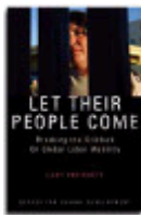
Let Their People Come: Breaking the Gridlock on Global Labor Mobility