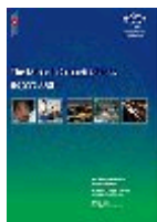
Mexico Competitiveness Report 2009