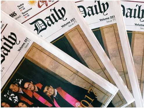
Events and News