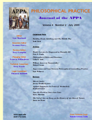
Volume 4.2, July 2009 see full cover here