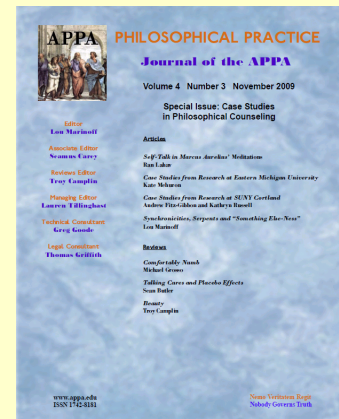
Volume 4.3, Nov. 2009 see full cover here

View Cover Vol 3.3 View TOC 3.3 View Abstracts 3.3