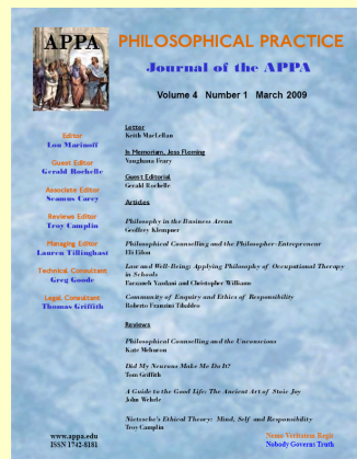
Volume 4.1, March 2009 see full cover here

Volumes 4.1, March 2009 / 4.2, July 2009 / 4.3, November 2009 are now available