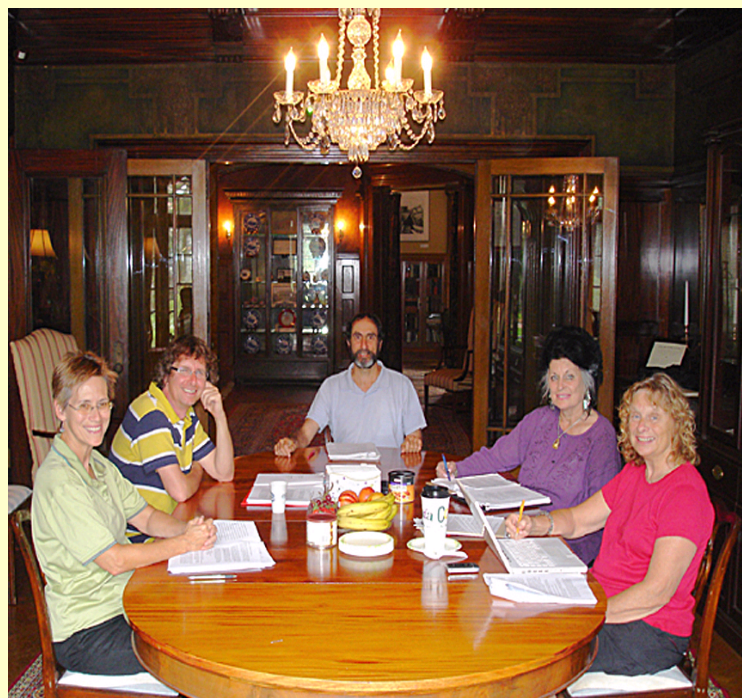
APPA Level 2 Certification Program for Philosophical Counselors Cortland, NY, August 2009